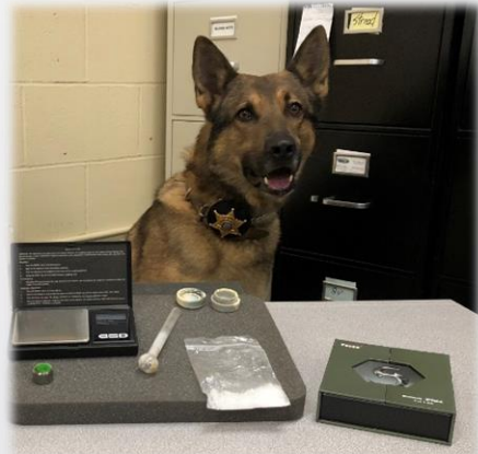
Deputy K9 Breck